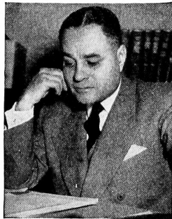
RALPH J. BUNCHE

Ralph Bunche, Phi Beta Kappa University of California, has been awarded the Nobel Peace Prize for 1950. The award will be presented in Oslo on December 10. Dr. Bunche, director of the United Nations Trusteeship Division, served as aide to Count Folke Bernadotte, the United Nations mediator in Palestine, and then as acting mediator after Bernadotte's assassination. As a result of his efforts, armistice agreements were signed between Israel and Arab countries.