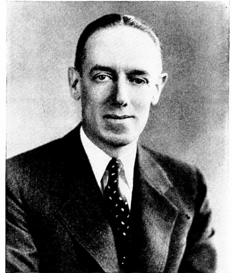
DETLEV W. BRONK

The address will be the eleventh in a series that has been sponsored by Phi Beta Kappa since 1935, upon invitation by the A.A.A.S., as a means of demonstrating the interdependence of the arts and sciences in a free society. The first lecture, entitled "The American Scholar Today," was given by William Allan Neilson. The following year James Rowland Angell was the speaker; his subject was "The Scholar and the Specialist." Subsequent speakers and their topics have been: George Lyman Kittredge — "Shakespeare and the Critics;" Frank Pierrepont Graves — "Is Education a Science?"; Marjorie Hope Nicolson — "Science and Literature"; Walter Lippman — "Education vs. Western Democracy"; Christian Gauss — "Can We Educate for Democracy?"; Harlow Shapley — "A Design for Fighting"; Irwin Edman — "Science and the Dream of Happiness"; and Theodore Spencer — "Science and the Poet".