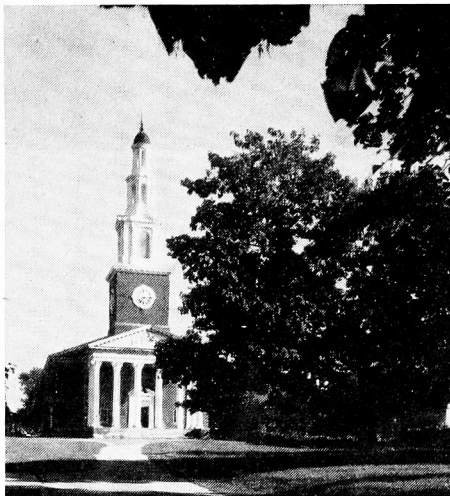
MEMORIAL HALL, UNIVERSITY OF KENTUCKY