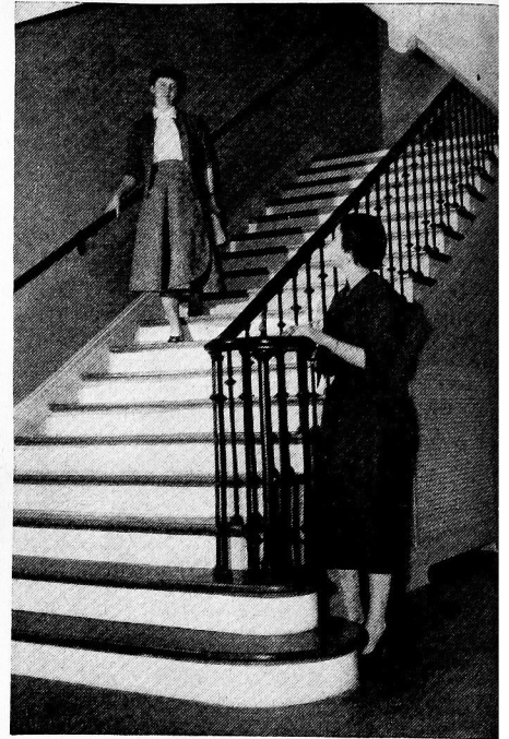
The Main Staircase

Pictures on these two pages were taken during the first month after the move.