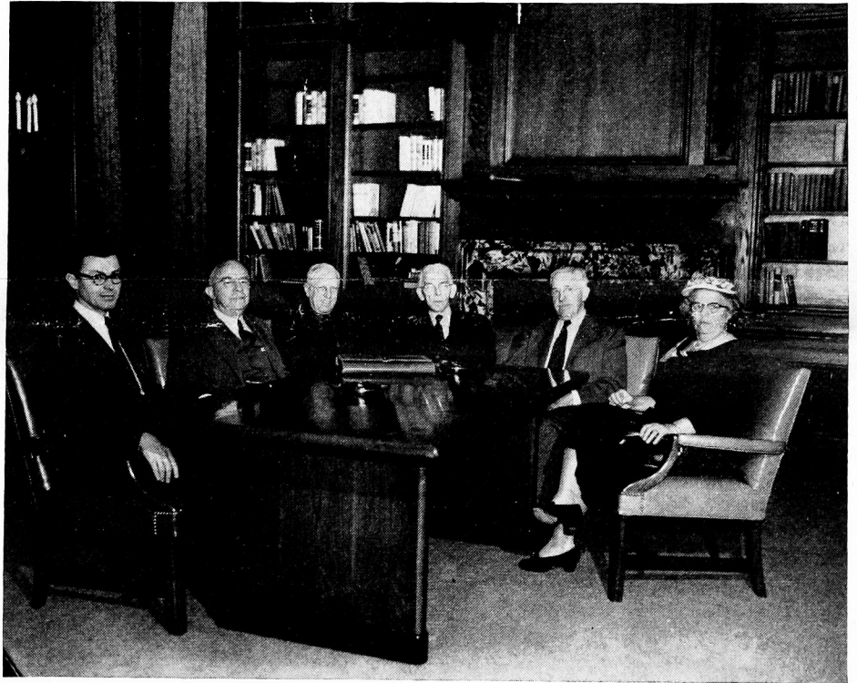
The conference room at the new ΦBK headquarters being used for the first time for an informal gathering before a meeting of the Executive Committee on March 30.