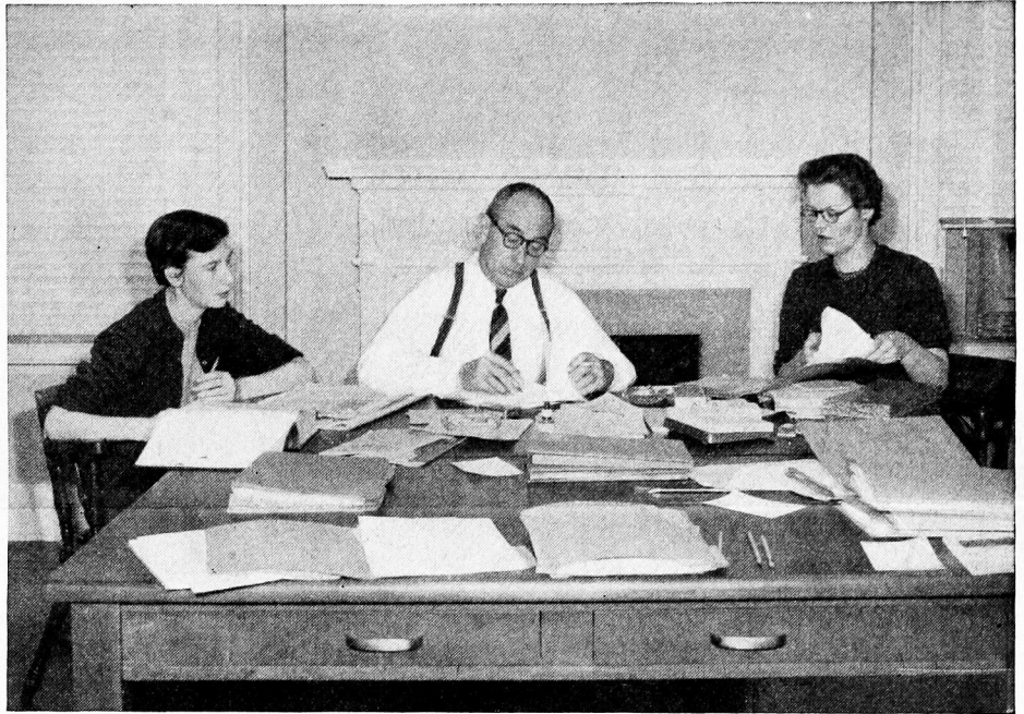
The American Scholar

The offices of THE AMERICAN SCHOLAR occupy most of the third floor, where for the first time since it was founded 23 years ago there is sufficient space and light. An editorial conference room, lined with shelves of reference books, and large enough to seat all twelve members of the Editorial Board, adjoins the offices.