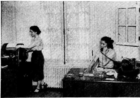
The Reception, Mimeograph and Mail Office

"I'm not going all the way up there again until the elevator has been installed."