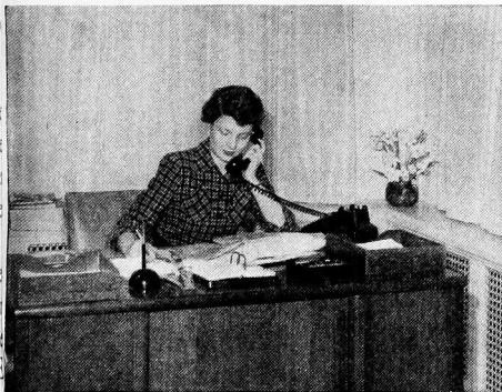
The Key Reporter

"Frankly, I'd cut out that whole paragraph."