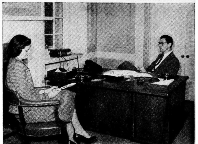
The Secretary and the Morning Mail

"Personally, I have never worked in such a lush setting. . . . No, make that 'elegant'."