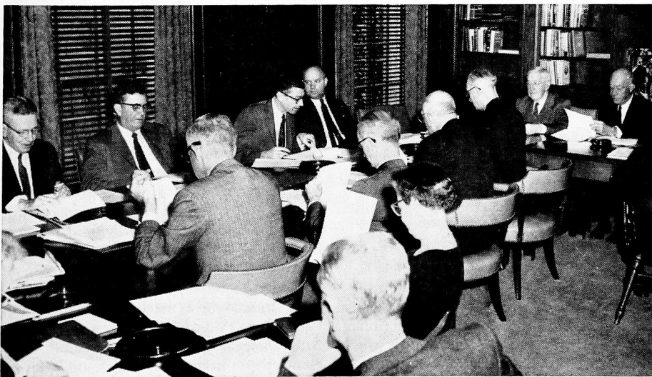
"Now if you will turn to page 16 of the agenda . . ."

The first Phi Beta Kappa Award in Science was presented by the Senate to Loren Eiseley, Professor of Anthropology and Provost at the University of Pennsylvania, for Darwin's Century , published by Doubleday and Company. It was characterized by one of the award judges as "an excellent book, written in a fine, distinctive, and easily flowing style combined with good scholarship and a beautifully balanced judgment."