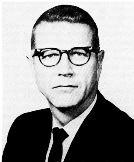
1962 Book Awards Winners

Herbert J. Muller (left) received the Award in History, Philosophy, and Religion. Christian Gauss Award winner is Wayne C. Booth. See back cover for additional photo.