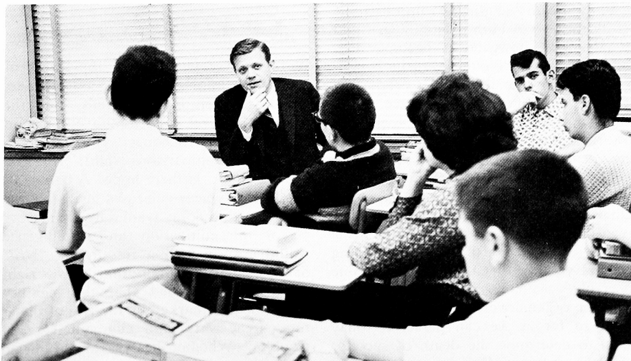
Dr. Hayden V. White, chairman of the department of history at the University of Rochester, talks to students at a Rochester high school. His visit was sponsored by the Iota Chapter of the University of Rochester.

The visiting scholar program is one of several activities which the chapter has sponsored to stimulate wider interest among members of the community in the humanities. For several years, the chapter has sponsored Sunday afternoon coffee hours on campus and has invited men and women prominent in the community to discuss informative and provocative topics.