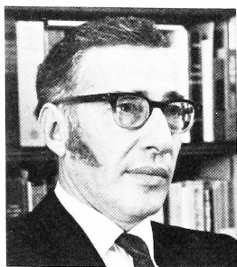
Donald W. Treadgold