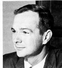
Eugene M. Shoemaker