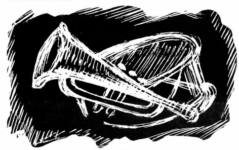
Sketches by Bea Goldberg

ignored the fact that it was unconstitutional, for by now the imperial constitution had met the fate of Humpty Dumpty; and such horses and men as the king had in America were nowhere near Philadelphia. When fighting broke out, royal government along the seaboard crumbled like a sand castle when the tide comes in. The rebellion began, like the rebellion of the south eighty-six years later, with a massive and uncontested victory for the rebels. The colonists achieved actual independence long before they declared it.