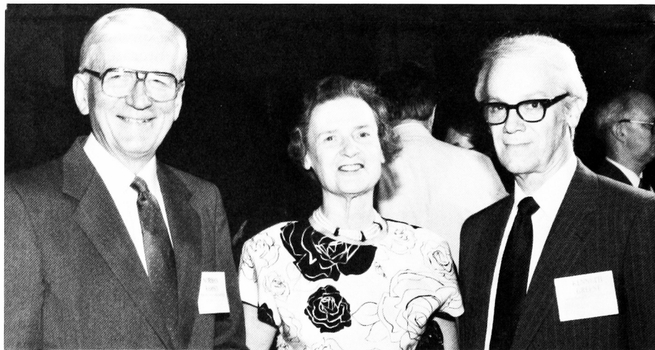
Norman F. Ramsey, left, immediate past president of Phi Beta Kappa, is pictured with his predecessor, Catherine S. Sims, and the Secretary of the Society, Kenneth M. Greene, at the triennial Council.

a term as senator. In announcing his retirement, Dilliard paid a warm tribute to John Hope Franklin's contributions to Phi Beta Kappa.