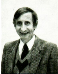
Science Award winner Freeman J. Dyson