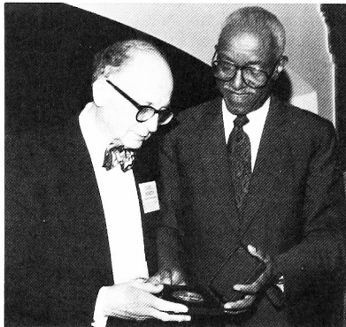
Daniel J. Boorstin, left, inspects the medal presented to him by John Hope Franklin at the triennial Council.

When I turn to Man the Creator I see quite another story. The works of Man the Creator seem somehow to be additive without being subtractive. In the world of literary creation, the world of the humanities, the world that man has made, there is always addition. Beowulf was not displaced by Dante, nor was Dante displaced by Milton. This is the magic of the humanities, man's power to expand his creations "infinitely in all directions." This