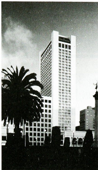
The Grand Hyatt San Francisco, facing Union Square, is headquarters for the 37th triennial Council.