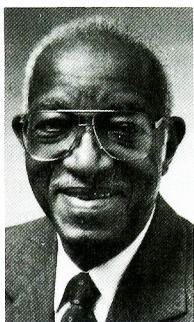
John Hope Franklin

Phi Beta Kappa will hold its 37th triennial Council on August 11-14 in San Francisco, with headquarters for the meetings at the Grand Hyatt Hotel on Union Square. A highlight of the weekend will be the presentation of the second Sidney Hook Award to John Hope Franklin, James B. Duke Professor Emeritus of History and professor of legal history in the Law School at Duke University. Franklin, a past president of Phi Beta Kappa (1973-76) and of the American Historical Association (1979), will deliver a lecture at the Council banquet on August 13.