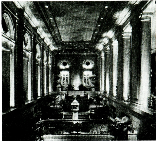
The Great Hall of the Chicago Hilton and Towers Hotel

The Phi Beta Kappa Associates will hold their annual meeting in conjunction with the Council and will present their annual award, which recognizes scholarly achieve-