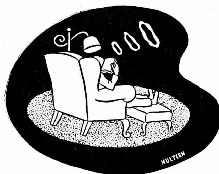
The Saturday Review of Literature

N. B.: Who said Phi Betes weren't so dumb?